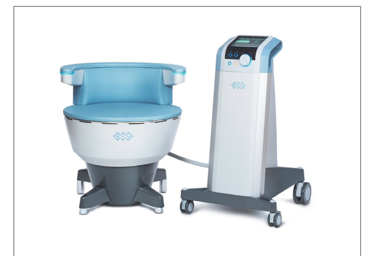
Figure 1: HIFEM device. The spiral coil is embedded in the center of the therapeutic chair and connected to the main unit, which supplies the whole system with power and allows the operator to adjust therapy settings.

to note that the lower the score the better QoL. The obtained results were compared to the baseline and statistically analyzed by a two-tailed paired t-test with the level of significance set as 5%. The Shapiro-Wilks test for normality verified the normality of data.